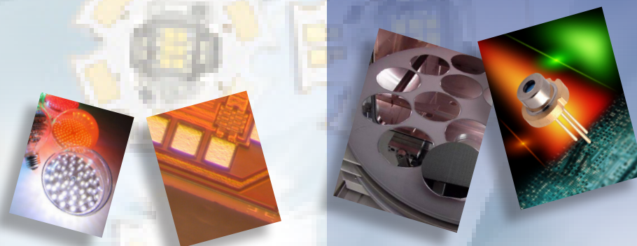
Pictures (above) from left to right: LED bulbs from LEDtronics; GigOptix's GX3110 chip; MOCVD reactor at Finisar; and Sanyo DL-8142-201 IR laser.

Close attention will also be given to areas where the compound and advanced silicon industries converge.